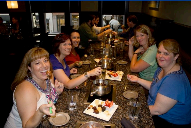
The Lansing Jaycees enjoyed fondue at The Melting Pot in Ann Arbor for the event Get Your Food On: Do You Fondue held Saturday, August 20.