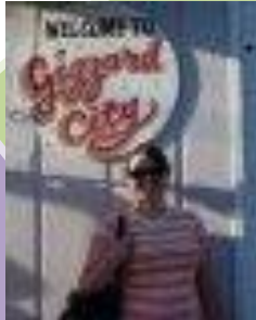
A. Clock at GYFO Gizzards