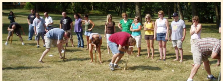
Road Rally Kick-Off – The Bat Spin Challenge

Great Job to everyone who participated – and Good News!! The winning team has already agreed to plan a 2009 Rally – something we can all look forward to!!