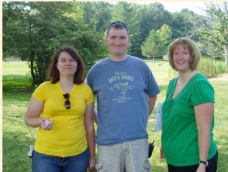
Winning Team: Never Nudes Anonymous