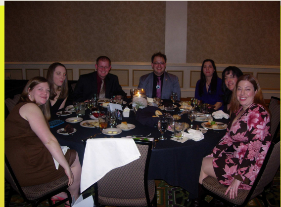
2009 Year End Banquet