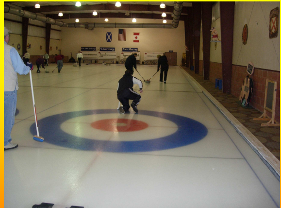
Learning to Curl!