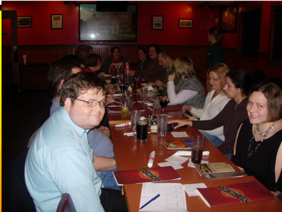
Our huge January Happy Hour at Old Chicago!