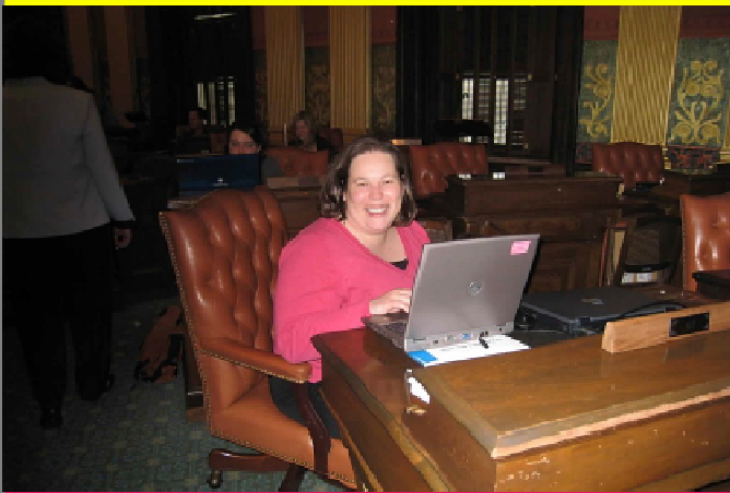
Representative May at Model Legislature