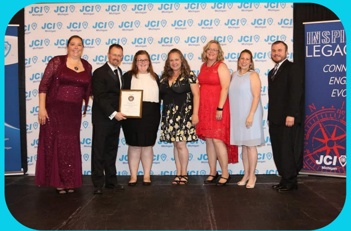
SPE Competition winner