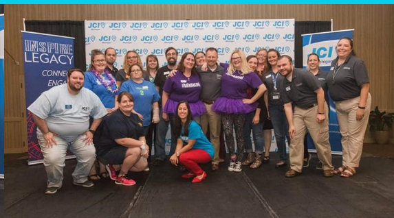
Passport to Leadership Degree achievers