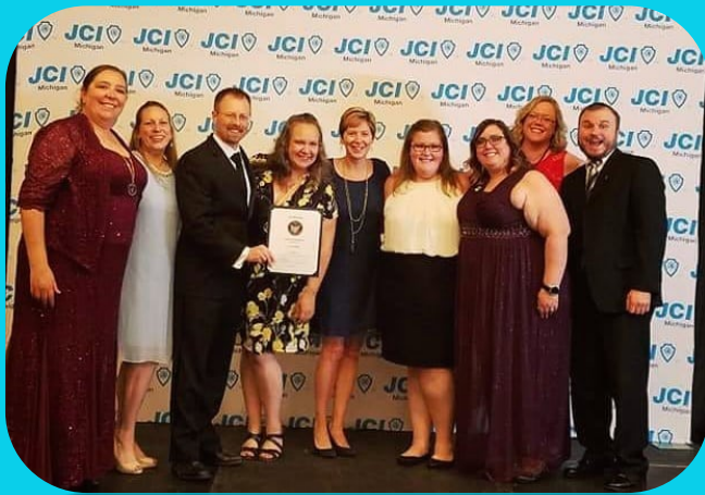
3rd place CLC