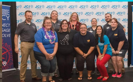
Local Officer Incentive achievers